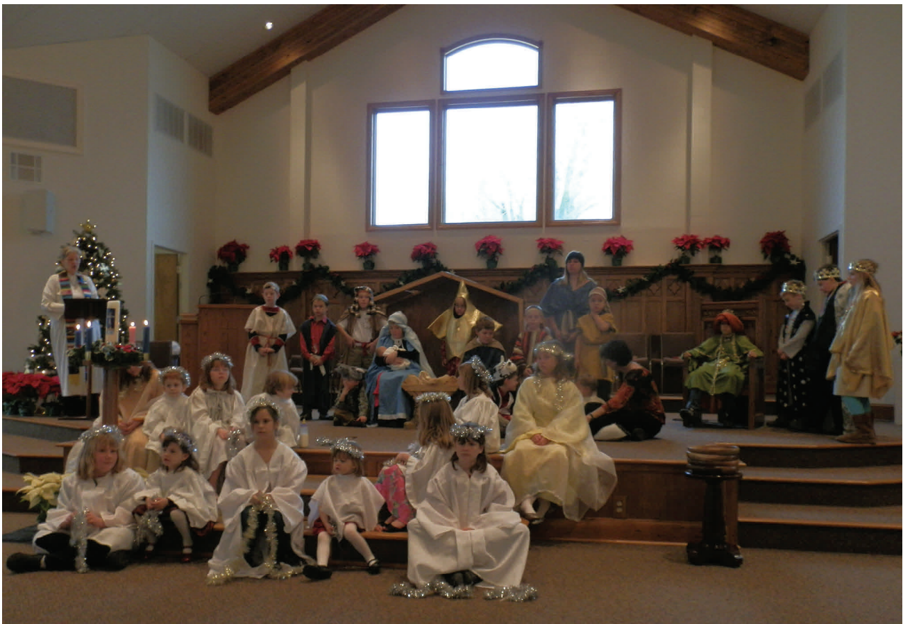
The Children of Immanuel presented the "Christmas Story" during worship on December 18

CHICKEN & DUMPLING DINNER has been scheduled for Saturday, January 28, beginning at 4:00 p.m. Once again, we will need to rely on our faithful helpers to make this the successful event it has always been. Prices are: Adults $10; Children 4-12 $5.00 and children 3 and under are free. We will be serving salad, chicken & dumplings, string beans and biscuits. With the various desserts being made by our congregation, there should be a wide assortment for your selection. Desserts are not included in the cost of the meal but are budget friendly. Where else could you go and get homemade desserts for a couple of dollars? So, mark your calendar and come out and enjoy a evening of fellowship and good food!