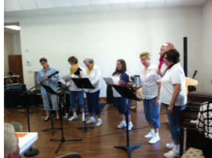
Members of our choir warm up the audience