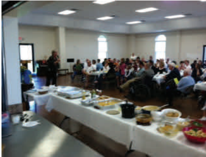
Our audience was superb