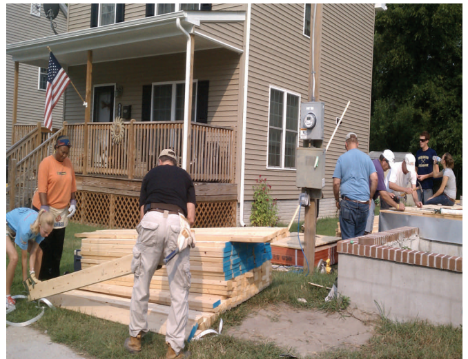
Pictures of volunteers on the Habitat Build, Saturday, August 13, 2011